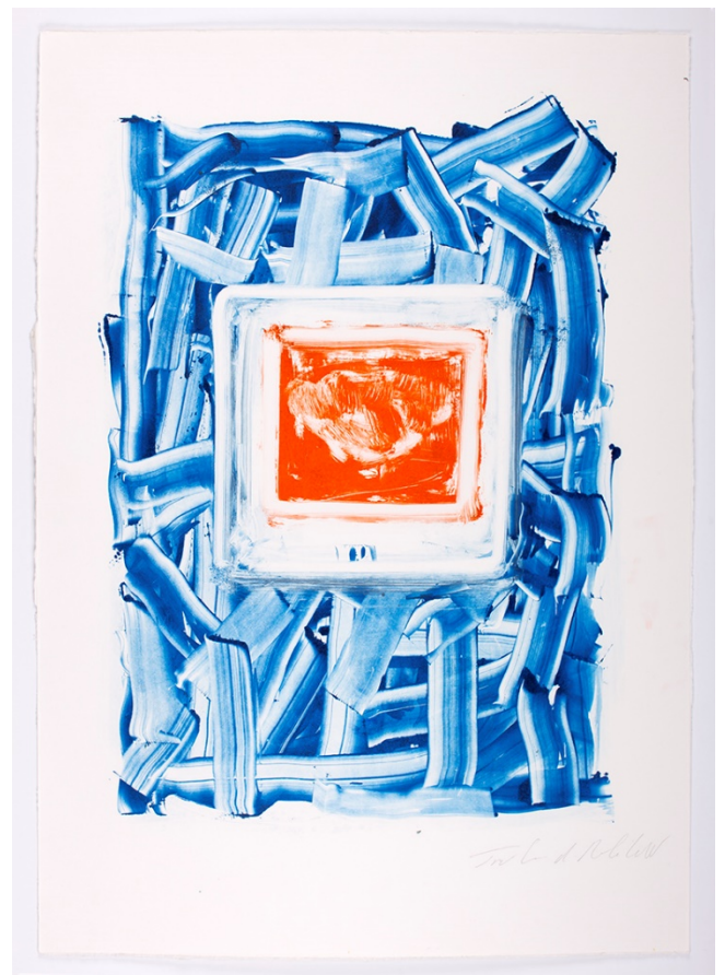
Tristano di Robilant Untitled, 2024 Monotype - cm 75 x 54