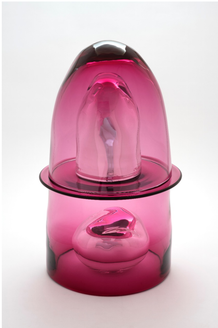
Tristano di Robilant La Sibilla, 2024 Hand blown glass - cm 58 x 35 x 35

The exhibition will include a large wall piece in ceramic, composed of different ceramic panels painted and fired in Ripabianca, Umbria. The glass pieces are all hand blown in Murano with the collaboration of maestro Andrea Zilio, and maestro Andrea Salvagno. Also exhibited are a group of monotypes made for this occasion with the help of the Stamperia d'Arte Berardinelli in Verona.